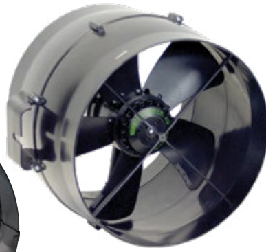
Plastic construction model (MTP)

A light-weight yet robust in-line fan available with either plastic or steel casing.