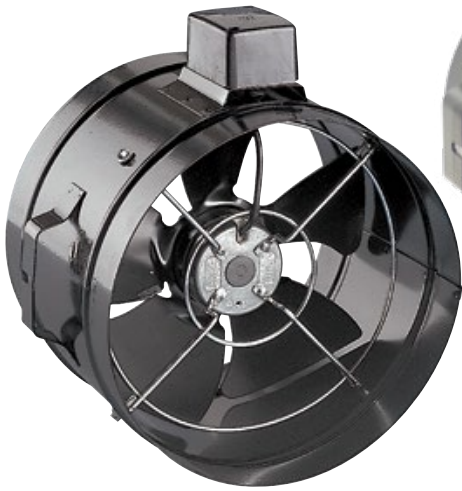
Metal construction model (MTS)