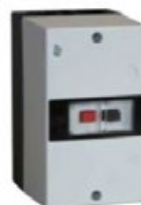
Motor Protection Switch (MPS)