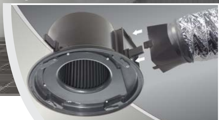
Long clip-in spigot makes installation and duct connection easier.