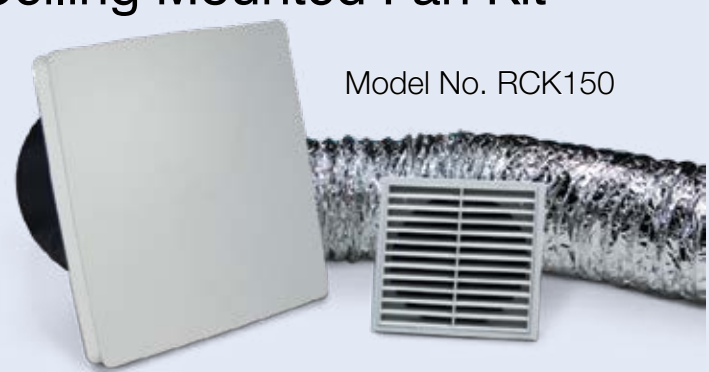
Model No. RCK150

Includes Response ceiling mounted header box exhaust fan with grille, 6m duct & external grille.