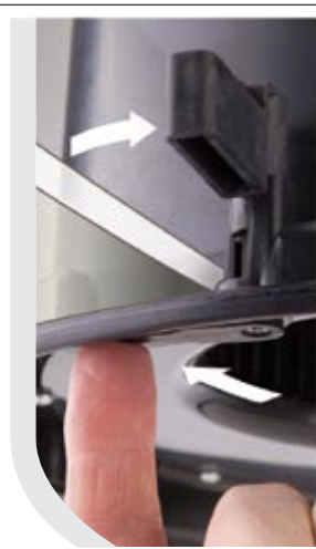
Rotate swing clips to hold fan body in place.