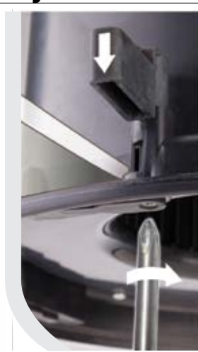
Tighten screws so clips clamp onto ceiling board.